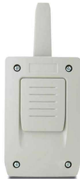
AED868 · FLAT868 ACTIVAGO · CONNECT

As accessories to the MOTION receivers, JCM offers antenna extensions and interfaces to make its 868 MHz range compatible with its 433 MHz or to pass the 868 MHz frequency to the Bus LIN, Wiegand or Clock&Data output.